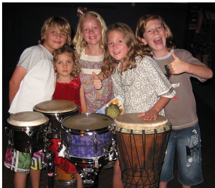
Enjoying the Synergy Percussion concert in February 2011

To enhance the appreciation and enjoyment of music by people of all ages in the South West Region by providing access to and opportunities for quality music education.